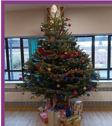
Christmas tree for the day room donated by the Friends.