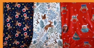
Each Patient staying over night at Christmas, was given a festive blanket to keep, donated by the Friends. The 29 beds are always full.