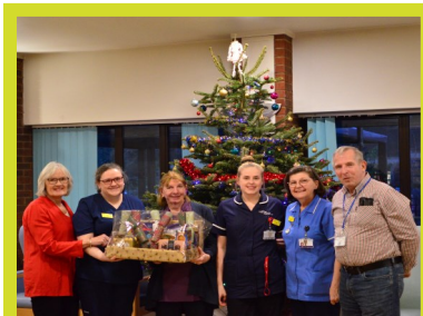
Nurses and staff and District Nurses based at Caterham Dene were presented with hampers from the Friends.