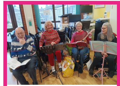
Singers and musicians from Luke's Larks, and members of the public joined in at the Dene's Christmas Carols